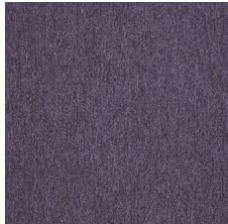
Plum Martini 71965