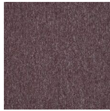
Rose Trellis 71830