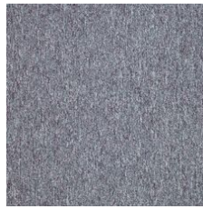
Icy Azur 71900